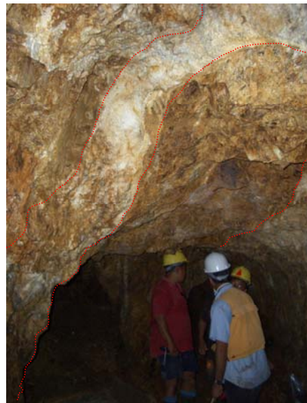
Sampling epithermal vein material (red dashed outline)

Alteration types and quartz vein textures observed at Tambang Hitam indicate low depositional temperatures, which imply that most of the gold-bearing system remains intact below the current topography.